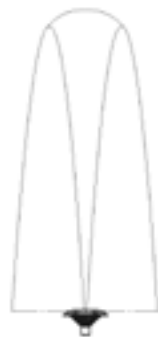
Spruce 31' H x 12' W