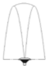
Birch 24' H x 14' W